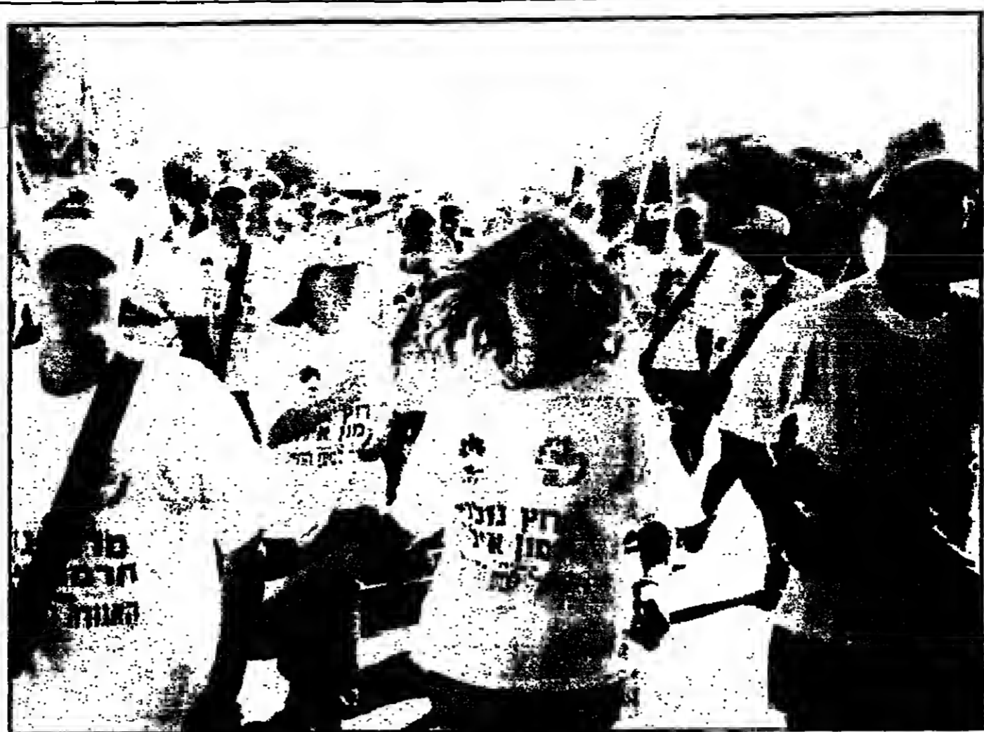
17th Golani Run Golani Brigade soldiers keep up the pace Sunday on their annual Mt. Hermon to Ellat run, which is to end Thursday.